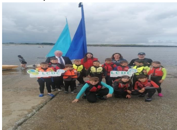
Rosses Point Sailing Course – Rosses Point Sligo