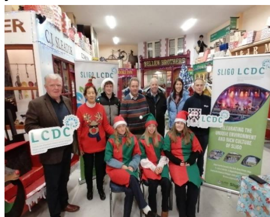
Ukrainian Christmas Night – Riverstown Folk Park