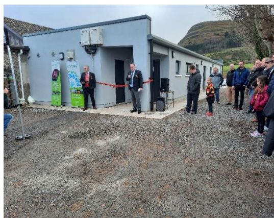
Official Opening of new dressing rooms at Sligo Rugby Club December 2023 – Funded under the Transitional LEADER Programme

In 2023 the LEADER Programme 2023-2027 was launched with an allocation for County Sligo of €6,054,309. The Local Action Group (LAG) submitted a Draft Local Development Strategy to the DRCD on 14 th July 2023. Following requests for clarifications, the Local Development Strategy was approved by the Department of Rural and Community Development in November 2023 with Sligo LCDC as LAG, Sligo Leader Partnership CLG as Implementing Partner and Sligo County Council as Lead Financial Partner to deliver the new programme for the coming years. Subsequently, the funding agreement between all parties was signed in December 2023.