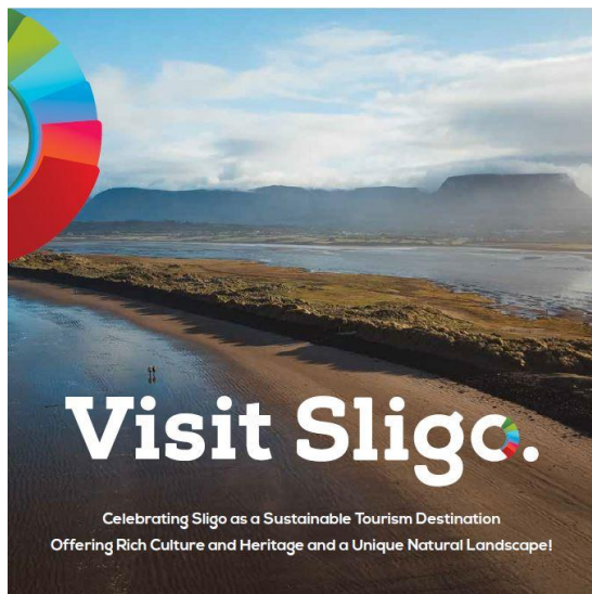
New Visit Sligo brochure

A new high quality Visit Sligo brochure has been produced. The brochure has been produced to reflect the visit pillar of Sligo: Live Invest Visit and features spectacular high-resolution imagery from around the County including Mullaghmore, Lough Gill, Aughris and Portavade.