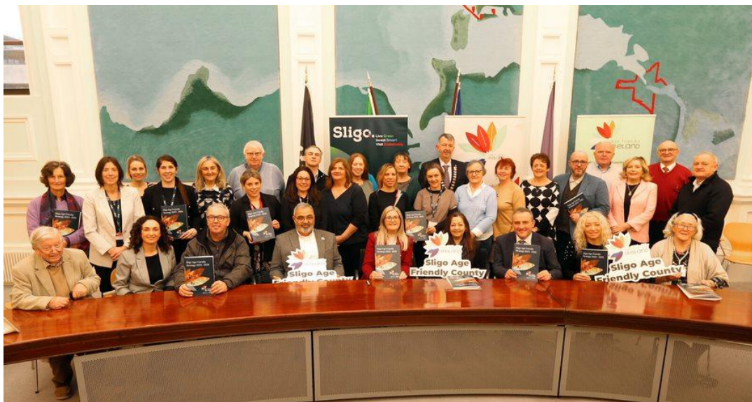
Pictured above are members of Sligo Age Friendly Alliance, Sligo Older Peoples Council , Age Friendly Ireland and SCC Staff at the Sligo Age Friendly Strategy launch, City Hall