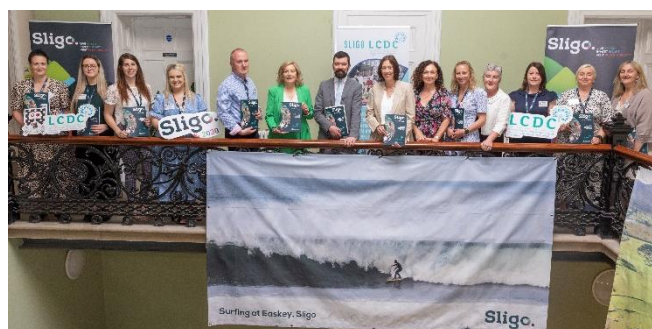
Minister Joe O'Brien, distinguished guests and Sligo County Council staff at the launch of the LECP – Sligo 2030: One Voice One Vision