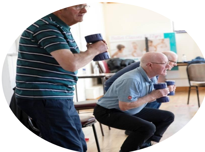
Men at work in St Brigid's Hall Tubbercurry.